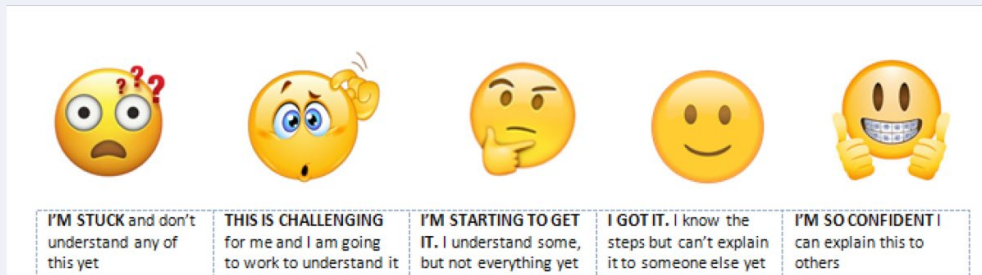
Image A. Students use emojis and text to self-assess their level of understanding.