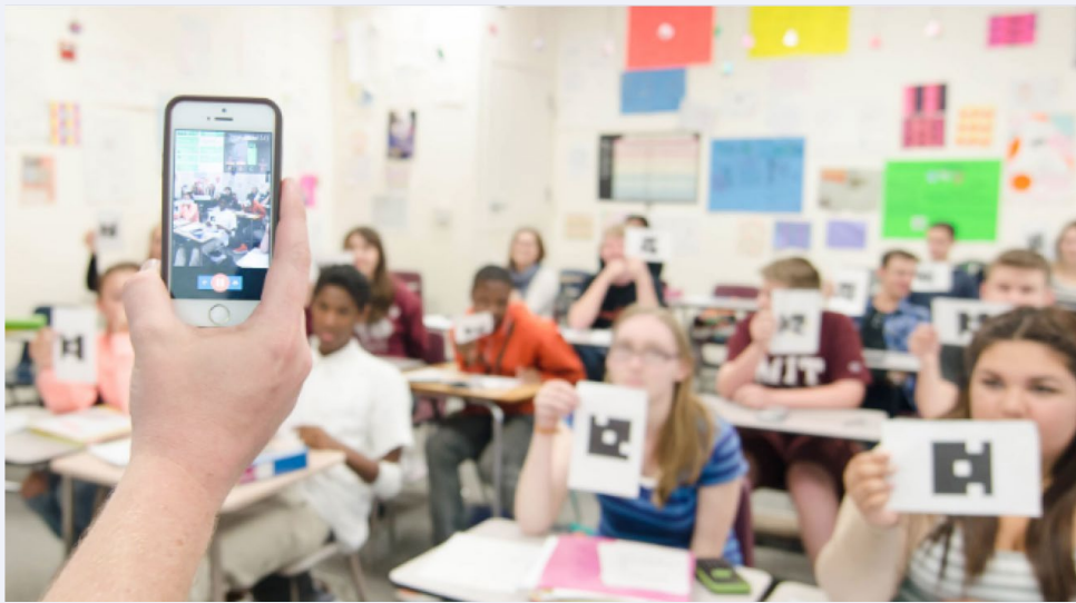
Image B. Teacher quickly reads students' QR codes to get a sense of their level of understanding.